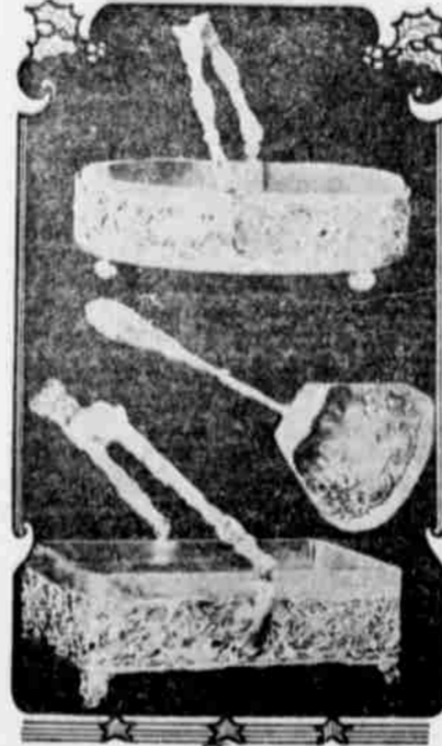
SILVER AND GLASS BONBON DISHES. Illustration shows two of the new bon bon or cake dishes in silver deposit work fitted with glass trays.

The silversmiths have brought out many charming designs in silver dishes for Christmas presents. The illus-