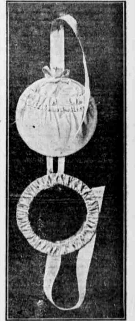
VANITY CASE. of cotton wadding laid between, are stitched together on the edge.

Millady will like the useful little vanity case seen in the illustration which is made of ribbon. Just the proper size to slip in her purse or hand bag. For this, wide satin ribbon is selected and two pieces of it, with a flat bit