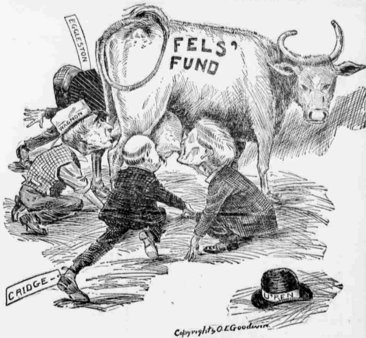
THE WORK FOR SINGLE TAX WILL CONTINUE AS LONG AS THE FUNDS

EVEN THE FELS' SINGLE TAX COW LOOKS WORRIED