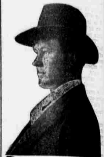
To the Voters of Coos County, Oregon: