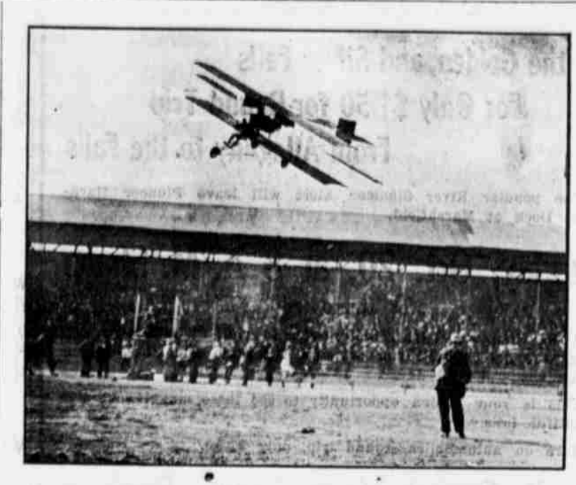
FLYING OVER THE GRAND STAND AT AN AVIATION MEET