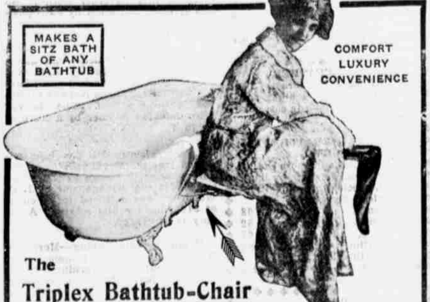
COMFORT LUXURY CONVENIENCE

Hub Clothing & Shoe Co. Bandon. Marshfield.