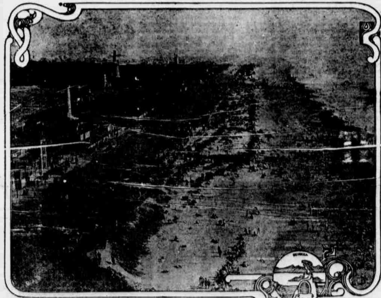
PACIFIC OCEAN BEACH FRONTING THE EXPOSITION SITE IN GOLDEN GATE PARK.

In preparing for the Panama-Pacific International exposition hundreds of its emissaries are visiting all the regions of the world. Fourteen governors of western states on a 4,000 mile trip through the east on a special train recently called attention to the exposition and became better acquainted with their brothers of the eastern states.