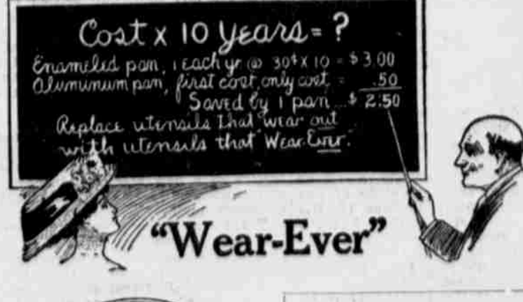
Figure This Out Yourself