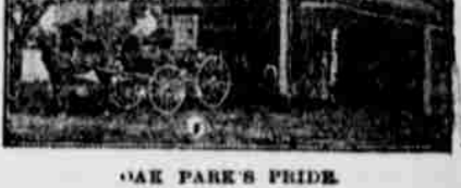
OAK PARK'S PRIDE ness to tackle any size fire and gain control before it has an opportunity to spread.

A good organization of fire fighters is an asset not to be lightly considered. It should be the pride of every town to have its fire fighting corps in readiness to tackle any size fire and gain control before it has an opportunity to spread.