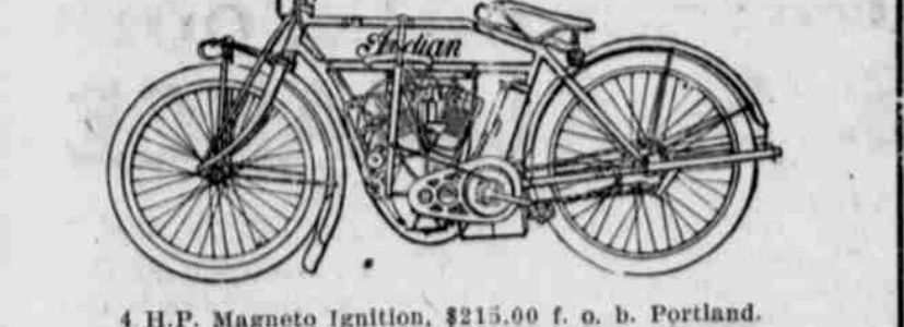
4 H.P. Magneto Ignition, $215.00 f. o. b. Portland. Other models and prices may be obtained by inquiring at our store.