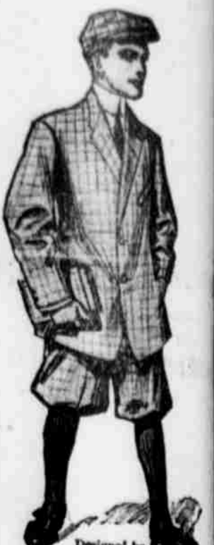
Designed by Becker, Mayer & Co., Chicago