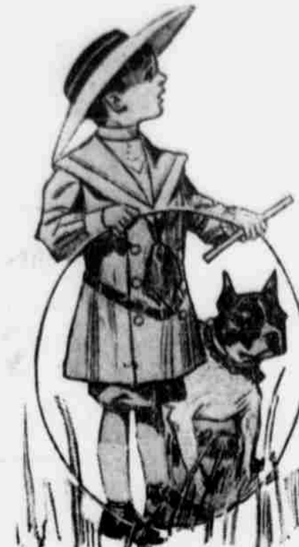
Designed by Becker, Mayer & Co., Chicago