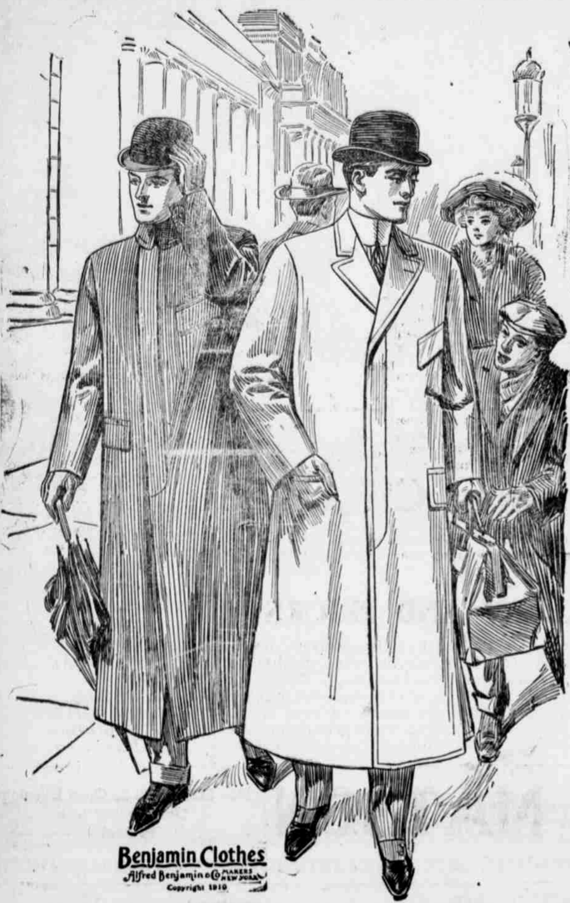
Benjamin Clothes Alfred Benjamin & Co. Portland, Ore. Copyright 1910.