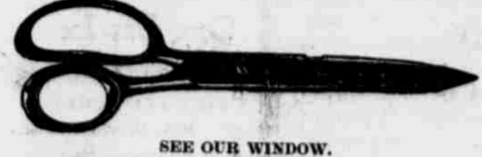
SEE OUR WINDOW.

THERE IS NOTHING EQUAL TO SOMETHING PRACTICAL AS WELL AS ORNAMENTAL. WE HAVE JUST THE THINGS SOMETHING THAT MAY BE USED EVERY DAY IN THE YEAR AND BE A CONSTANT REMINDER OF YOUR KINDNESS AND THOUGHTFULNESS.