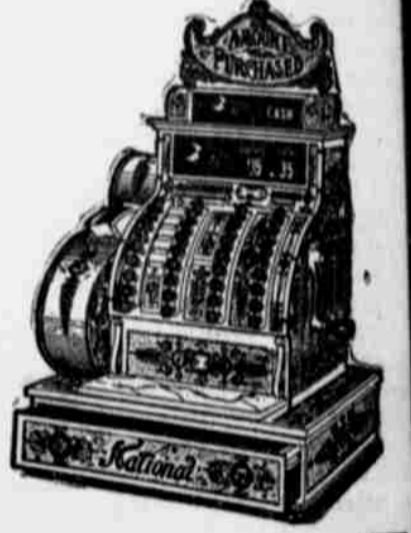
No. 442, Price $200. Total adder with all the latest improvements and 6 clerks initial keys. Charge, Received on Account and Paid Out keys, with detail strip and check printing attachment.