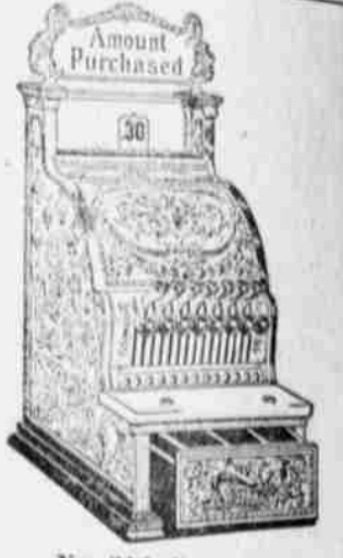
No. 313, Price $35. Total adder with all the latest improvements. 15 keys from 5c to $1.55.

You count it very carefully when you take it to the bank next day.