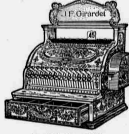
No. 349, Price $100. Total adder with all the latest improvements; including detail strip, printing attachment. 27 keys, 5c to $6.95. Charge, Received on Account and Paid Out keys.

A National Cash Register provides the STORE SYSTEM that PREVENTS MISTAKE prevents FAILURE TO CHARGE and PROTECTS EVERY PENNY OF YOUR MONEY.