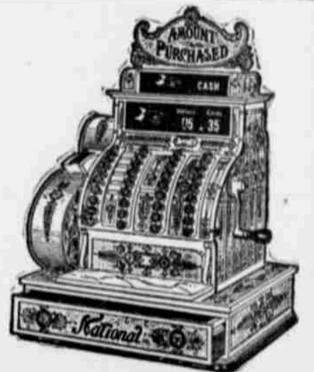
No. 442, Price $200. Total adder with all the latest improvements and 6 clerks initial keys. Charge, Received on Account and Paid Out keys, with detail strip and check printing attachment.