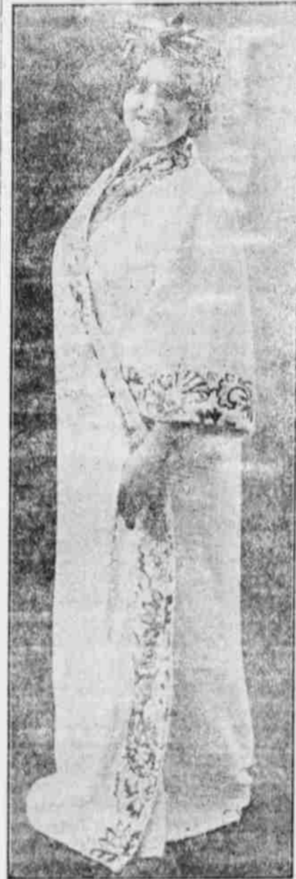
OF BLUE BORDERED TURKISH TOWELING.

A good bathrobe is an expensive thing to buy, but a stunning robe may be made by the skillful seamstress of blue bordered Turkish toweling like