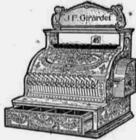
No. 340, Price $100. Total adder with all the latest improvements; including detail strip, printing attachment. 27 keys, 5c to $6.95. Charge, Received on Account and Paid Out keys.

A National Cash Register provides the ONLY STORE SYSTEM that PREVENTS MISTAKES, prevents FAILURE TO CHARGE and PROTECTS EVERY PENNY OF YOUR MONEY.