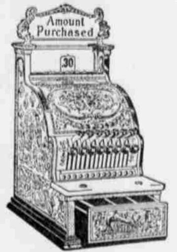
No. 313, Price $35. Total adder with all the latest improvements. 15 keys from 5c to $1.95.

You count it very carefully when you take it to the bank next day.