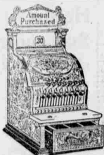
No. 313, Price $85.

You count it very carefully when you take it to the bank next day.