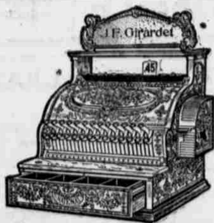
No. 340, Price $100.

A National Cash Register provides the ONLY STORE SYSTEM that PREVENTS MISTAKES, prevents FAILURE TO CHARGE and PROTECTS EVERY PENNY OF YOUR MONEY.