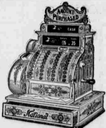
No. 442, Price $200.

Total adder with all the latest improvements; including detail strip, printing attachment, 27 keys, 5c to $6.95. Charge, Received on Account and Paid Out keys.