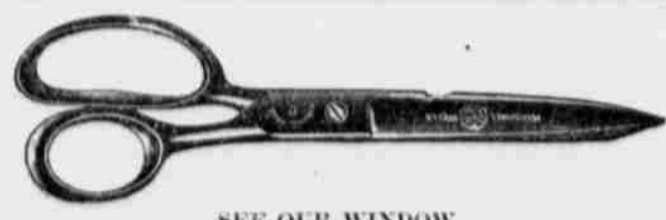
SEE OUR WINDOW.

THERE IS NOTHING EQUAL TO SOMETHING PRACTICAL AS WELL AS ORNAMENTAL. WE HAVE JUST THE THINGS SOMETHING THAT MAY BE USED EVERY DAY IN THE YEAR AND BE A CONSTANT REMINDER OF YOUR KINDNESS AND THOUGHTFULNESS.