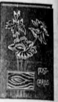
Post Card Albums, 5c to $5.00.

Never before could we show you such an extensive assortment embracing volumes of interest for every member of the family. There is nothing more appropriate than a book or one that carries with it so much the sentiments and suggestions of the Holiday season.