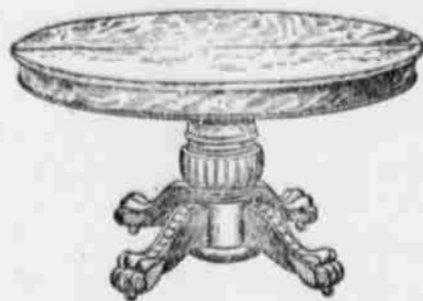
A PRETTY TABLE IS APPRECIATED BY THE WHOLE FAMILY $7.50 TO $15.00