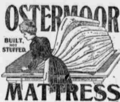
OSTERMOOR BUILT, NOT STUFFED MATTRESS WE ARE AGENTS FOR THIS WELL-KNOWN MATTRESS, SEVERAL DIFFERENT STYLES CARRIED IN STOCK AT FACTORY PRICES