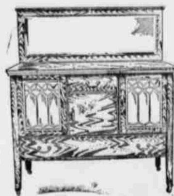
BUFFETS ARE USEFUL FOR THE WIFE $25.00 TO $57.50