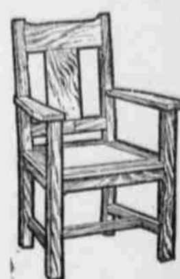
DINING CHAIRS ALL STYLES, PRICES: 75 CENTS TO $6.00