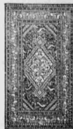
OUR ASSORTMENT OF RUGS IS VERY COMPLETE AT THIS TIME BOTH IN THE SMALL AND ROOM SIZES.

Our Toy Department is now on Display BIGGER, BETTER and GREATER THAN EVER BEFORE GOING & HARVEY COMPANY WE SAVE YOU MONEY