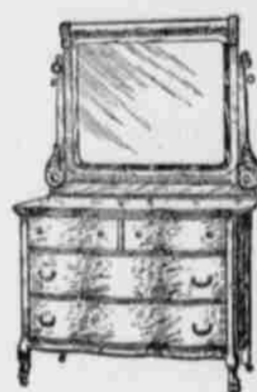
DRESSERS IN ALL STYLES $7.50 TO $35.00