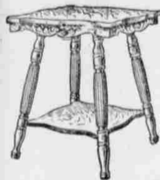
STANDS AND LIBRARY TABLES ALL KINDS AND FINISHES PRICES FROM $1.25 TO $25.00