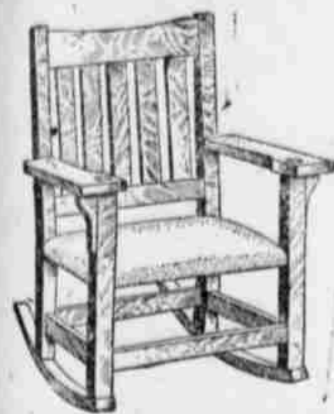
A PRETTY ROCKER WOULD BE NICE FOR THAT PARLOR $1.75 TO $25.00

For the past Thirty Days we have been Receiving carload after carload of Holiday Supplies. Now is The time to begin Selecting Your Presents while the Assortment is Large A Sensible Present is Appreciated by Mother, Father, Wife and Friend