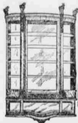
CHINA CLOSETS TO COMPLETE YOUR DINING ROOM $25.00 AND UP.