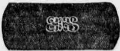
SMART EYEGGLASS CASE.

A silver eyeglass case would be a happy offering either to father or mother. If father is to receive the case a black leather affair with his monogram done in silver on one side would be most appropriate. Mother would doubtless rather have an all silver case. If the head of the house