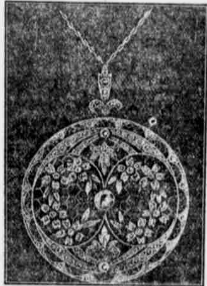
LA PLAQUE, THE NEW ORNAMENT.

If you give your best girl a pendant she will be charmed, but should you select the latest ornament from gay