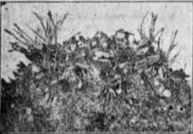
CENTERPIECE OF HOLLY, MOSS AND ORANGES.

For a place card use a poinsettia blossom, with a tiny doll head set in the cup of flowers. Should one not wish to use the poinsettia plants as favors the small red sleds filled with candy