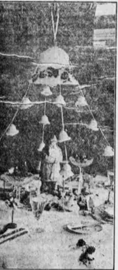
THE SANTA CLAUS TABLE.

Here is a table that can be arranged with but little trouble and expense. The centerpiece consists of a toy figure of old Santa Claus standing on a mound of snow made from cotton batting. On this mound are placed little Christmas favors done in tissue paper and sealed with Christmas seals. A wreath of holly surrounds the centerpiece. The place cards are bells, and the nut dishes are made from pink and green tissue paper, while a row of tiny candles surrounds the center of the mound. A large Christmas bell