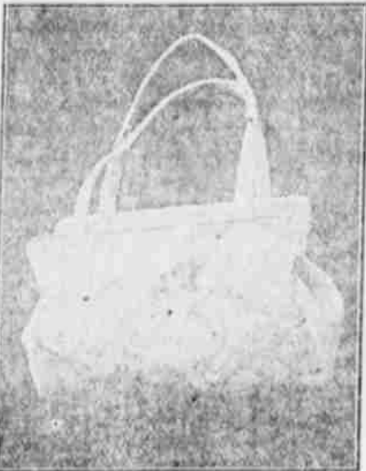
VELVET SHOPPING BAG.

Mother can never have too many shopping bags, for they have an unpleasant habit of wearing out very