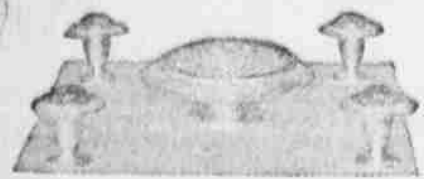
SET OF FLOWER HOLDERS FOR THE TABLE.

Red is the Christmas color, and the more vivid a table is the more appropriate. Formerly the tone was given by holly and red ribbon, but lately the poinsettia has superseded everything.