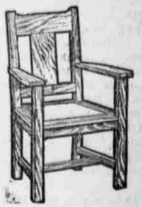
DINING CHAIRS ALL STYLES. PRICES: 75 CENTS TO $6.00