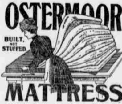
OSTERMOOR BUILT, NOT STUFFED MATTRESS WE ARE AGENTS FOR THIS WELL-KNOWN MATTRESS. SEVERAL DIFFERENT STYLES CARRIED IN STOCK AT FACTORY PRICES