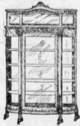
CHINA CLOSETS TO COMPLETE YOUR DINING ROOM $25.00 AND UP.