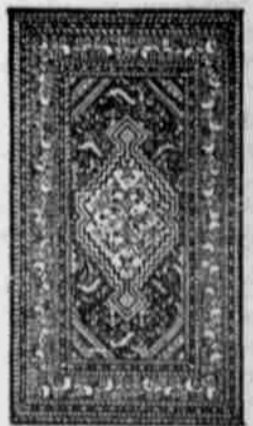
OUR ASSORTMENT OF RUGS IS VERY COMPLETE AT THIS TIME BOTH IN THE SMALL AND ROOM SIZES.

Our Toy Department will Soon be on Display BIGGER, BETTER and GREATER THAN EVER BEFORE