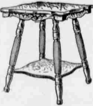
STANDS AND LIBRARY TABLES ALL KINDS AND FINISHES PRICES FROM $1.25 TO $25.00