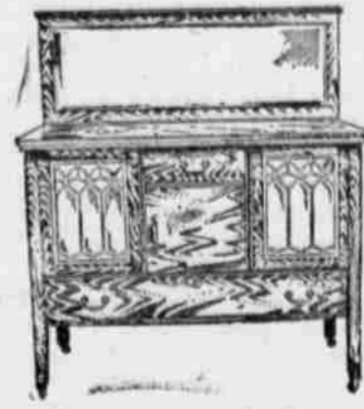
BUFFETS ARE USEFUL FOR THE WIFE $25.00 TO $37.50