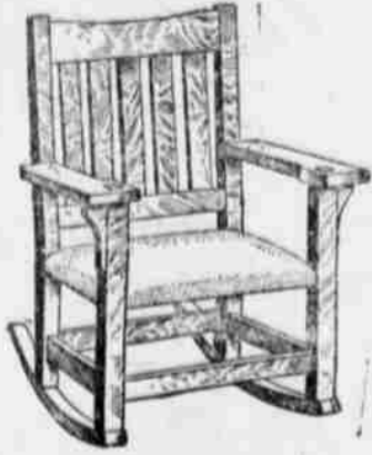
A PRETTY ROCKER WOULD BE NICE FOR THAT PARLOR $1.75 TO $25.00

For the past Thirty Days we have been Receiving carload after carload of Holiday Supplies. Now is The time to begin Selecting Your Presents while the Assortment is Large A Sensible Present is Appreciated by Mother, Father, Wife and Friend