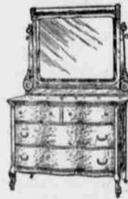
DRESSERS IN ALL STYLES $7.50 TO $35.00