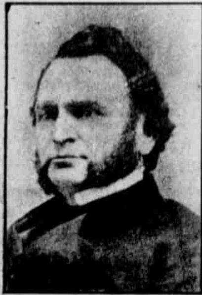
COL. JAMES WILLIS NESMITH. Illustrious Oregonian whose name the proposed county would perpetuate.

Owing to the large area of the two old counties affected many residents are put to great inconvenience, delay and expense in transacting business at the county seats. To compel residents to travel from twenty to sixty miles over bad roads in order to pay their taxes, serve on juries, or as witnesses, is to inflict a hardship