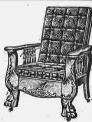
15 PER CENT OFF IN CHAIR DEPARTMENT.