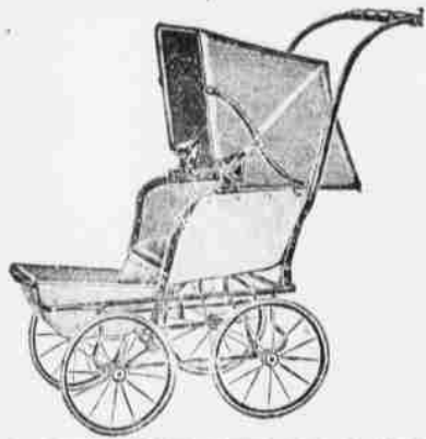
15 PER CENT OFF GO-CART DEPARTMENT.

MERCHANDISE IN MOST ALL DEPARTMENTS IS SACRIFICED.