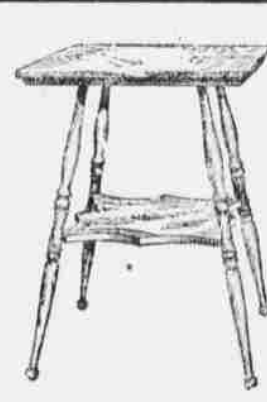
15 PER CENT OFF IN STAND DEPARTMENT.

All goods brand new 1910 styles Quality guaranteed by us