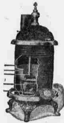
10 PER CENT OFF IN HEATER DEPARTMENT.