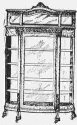
10 PER CENT OFF IN DINING-ROOM DEPARTMENT.