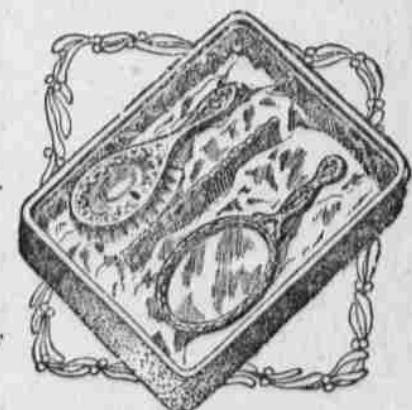
DRESSER SETS Ivory Comb, Brush and Glass. Ivory Comb and Brush.

Writing Case, Tobacco Jars, Work Boxes Stems, Brass Candle Sticks, Brass Jardiniers. HAND BAGS in Seal and Leather, latest styles. TRIPPLICATE MIRRORS. WHITINGS' BOX PAPER, 25c TO $3.00 PER BOX. BABY SETS. POST-CARD ALBUMS, 25c TO $3.00 In fact everything for Gentlemen, Ladies, Boys, Girls and Babies may be found here and it always has the artistic stamp of quality. The prices as you know are always Reasonable. Call and see