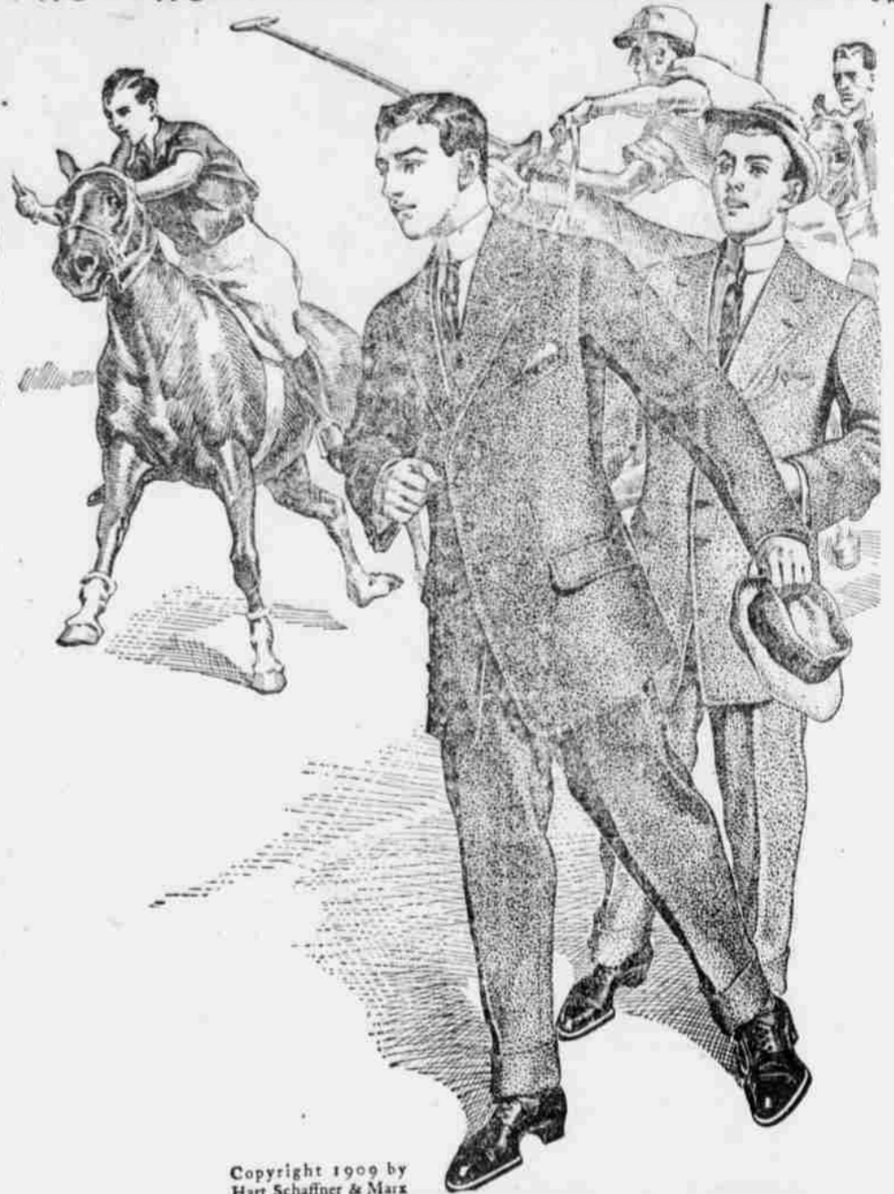
Copyright 1909 by Hart Schaffner & Marx