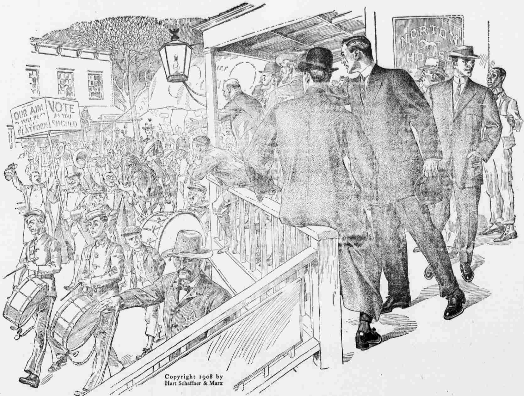
Copyright 1908 by Hart Schaffner & Marx

WHETHER TAFT OR BRYAN--Hait Schaffner and Marx will continue to stand at the head of the FINE CLOTHES SHOPS OF AMERICA.