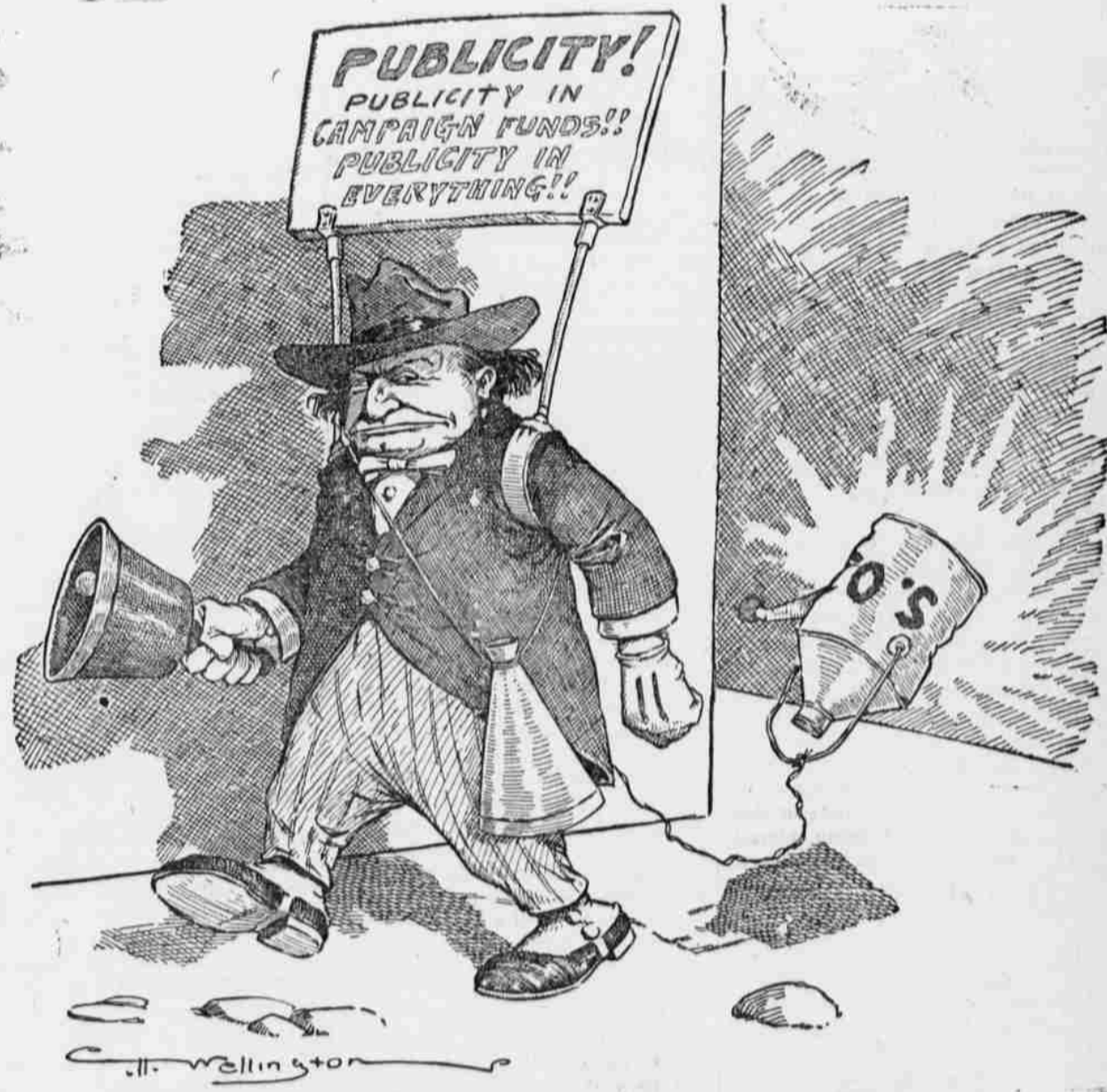
HE JUST WOULD HAVE PUBLICITY.