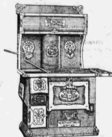
The favorably known Renown Steel Range, 6 holes, 18x16 oven, $27.80.