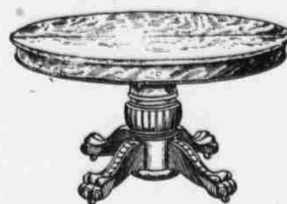
Round and Square Pedestal Extension Tables, finished in the American or quartered oak, at only $12.50 each