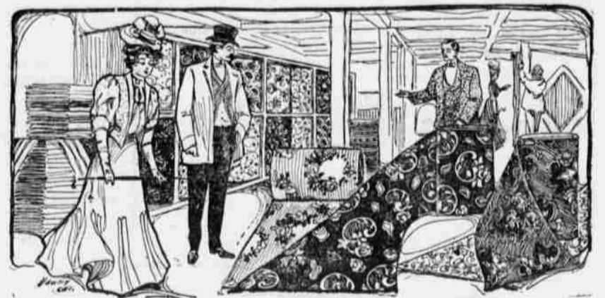
Carpets, Rugs, Linoleums, etc., all grades