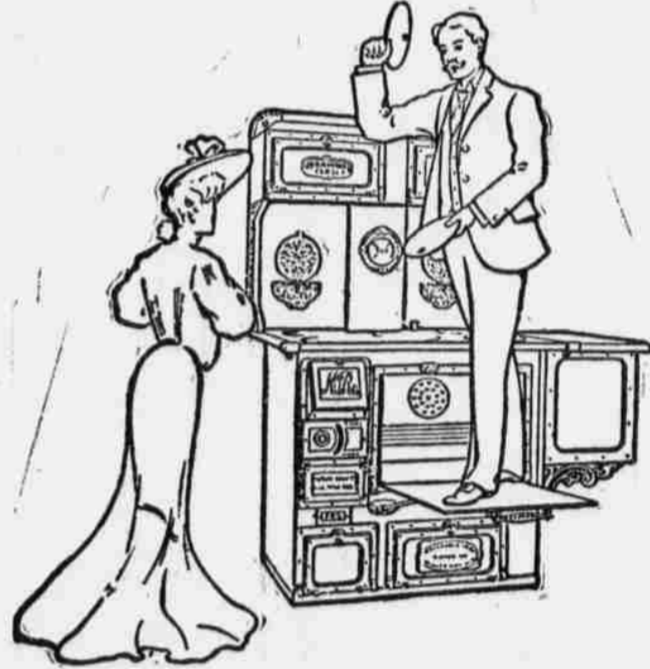
Regular $65.00 Special $54.00.

FAIR PRICES We Always Give You Fair Prices But in order to induce you to pay us a visit we are offering for Friday and Saturday some special prices