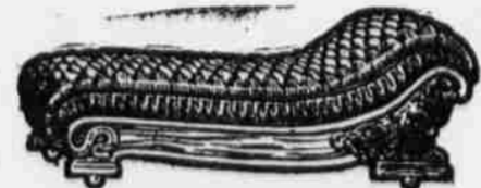
Genuine No. 1 Leather Couch. Regular $33.50 Special $25.00

With every $1.00 cash purchase you get a ticket on the Grandfather's Mission Hall Clock to be given away.