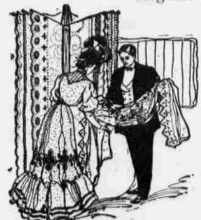
Our entire stock of lace curtains to select from at a reduction of 25 per cent.