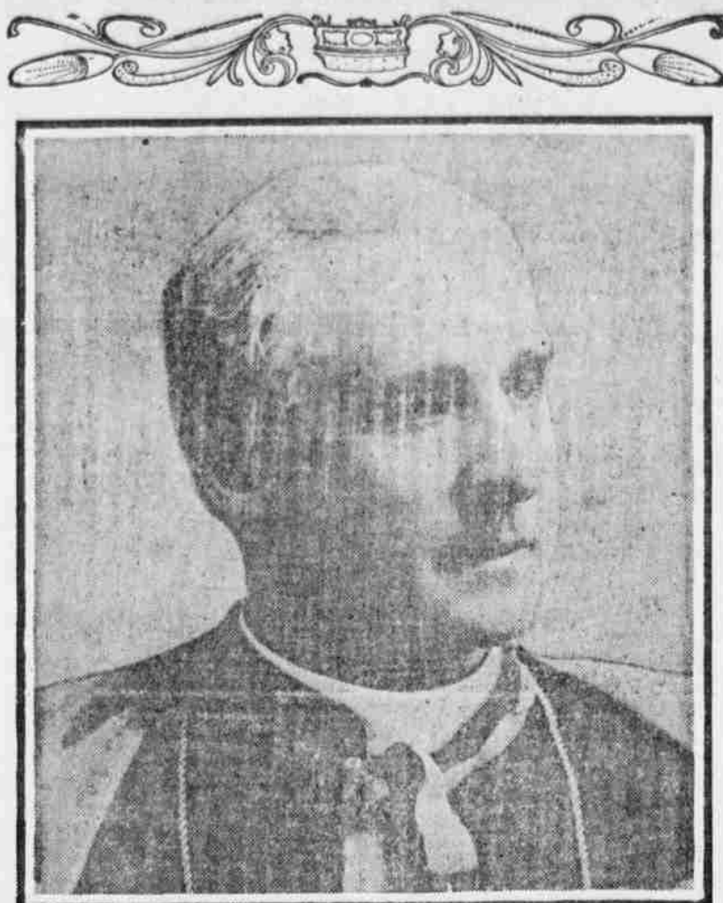
ARCHBISHOP FARLEY OF NEW YORK.

As usually treated, a sprained ankle will disable the injured person for a month or more, but by applying Chamberlain's Liniment and following the directions with each application, a cure may be effected in many cases in less than a week's time. This liniment is a remarkable preparation. Try it for a sprain or bruise, or when up with chronic or muscular rheumatism, and you are certain to be delighted with the prompt relief which it affords. For sale by JOHN REUSS.