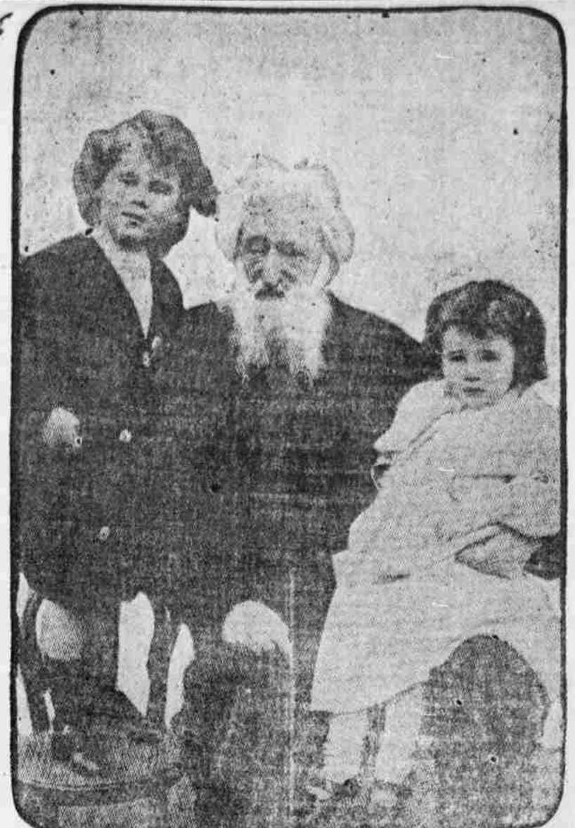
GENERAL WILLIAM BOOTH AT SEVENTY-NINE.

This picture of General Booth and his two little grandchildren was taken on the occasion of the seventy-ninth birthday of the founder of the Salvation Army. General Booth laid the beginnings of his army in 1865. He began by preaching in the slums of English towns and rendering material as well as spiritual aid to those he drew about him. This has since been the unswerving policy of the Salvation Army—to feed the hungry and comfort the despairing. General Booth is a strict vegetarian and a model of frugality in his manner of living.