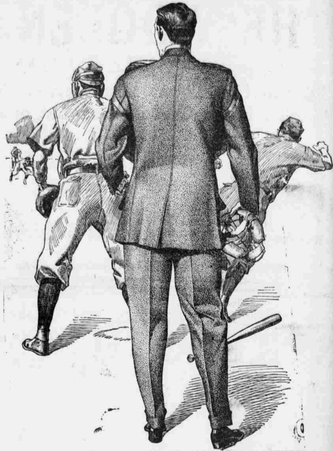
Copyright 1908 by Hart Schaffner & Marx

Knox - Stetson - Mundheim Hats Nettleton Shoes