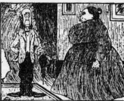
A Warm Place.