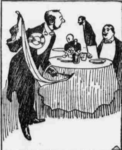
Too Much Diabolo.

Customer—Salmon mayonnaise. Waiter (absentmindedly practicing for the Hired Menials' Diabolo handicap)—Yes, sir. Shall I spin it for you, or would you rather catch it if I throw it under your leg?—Tattler.