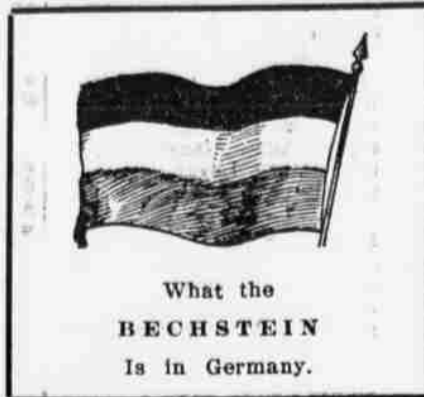
What the BECHSTEIN Is in Germany.