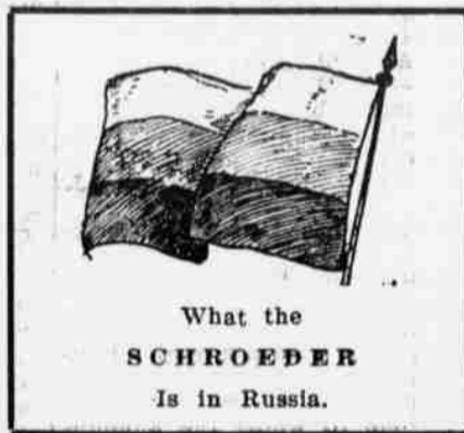
What the SCHROEDER Is in Russia.