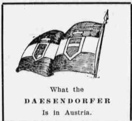
What the DAESEENDORFER Is in Austria.