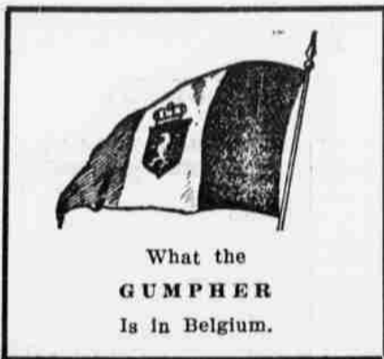
What the GUMPFER Is in Belgium.