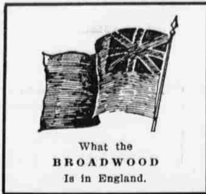
What the BROADWOOD Is in England.