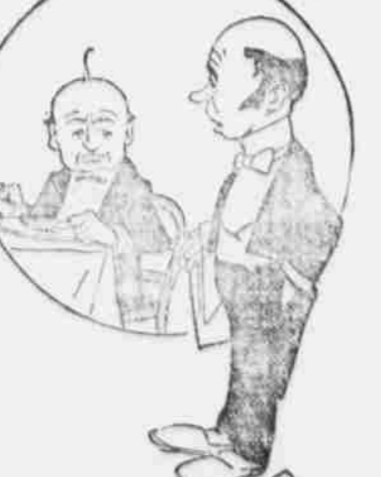
Guest—Here, waiter, this steak is absolutely vile. I won't pay for it. Where's the proprietor? Waiter—He's gone out to lunch, sir

FOR REPRESENTATIVE. I hereby announce myself a candidate for representative in the legislative assembly, subject to the approval of Coos County Republican electors at the primary election, April 17, 1908, and respectfully solicit the support of all Republicans.