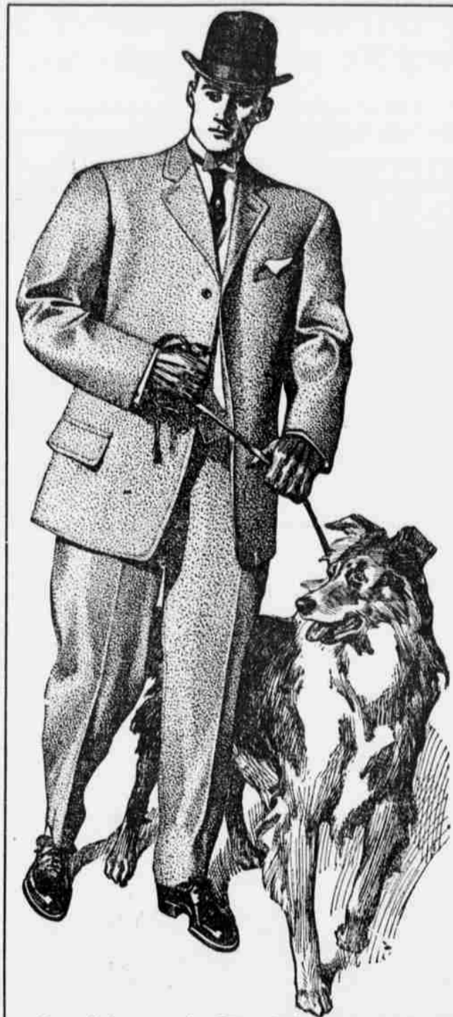
Copyright 1907 by Hart Schaffner & Marx