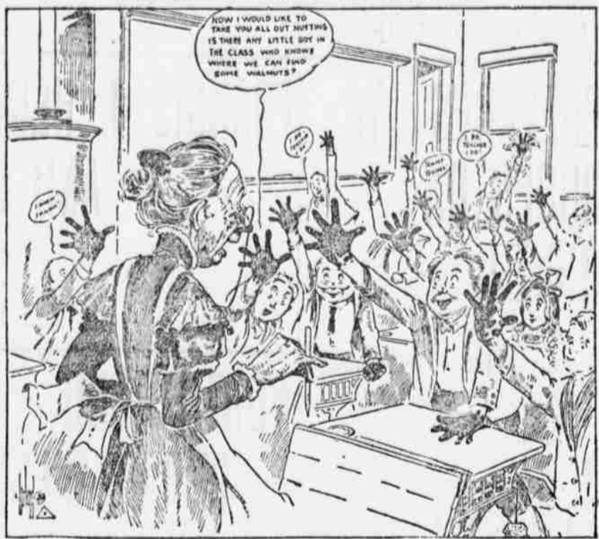
—Ireland in Columbus Dispatch.