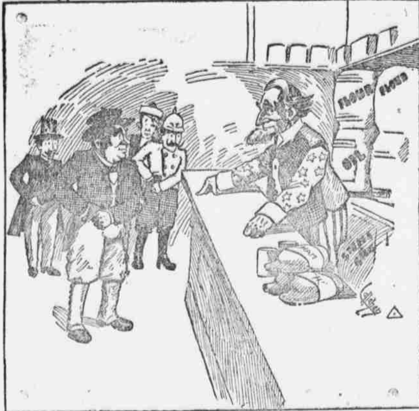
—Callahan in St. Paul Pioneer Press.