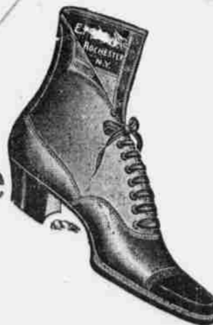
Julia Marlowe For Women