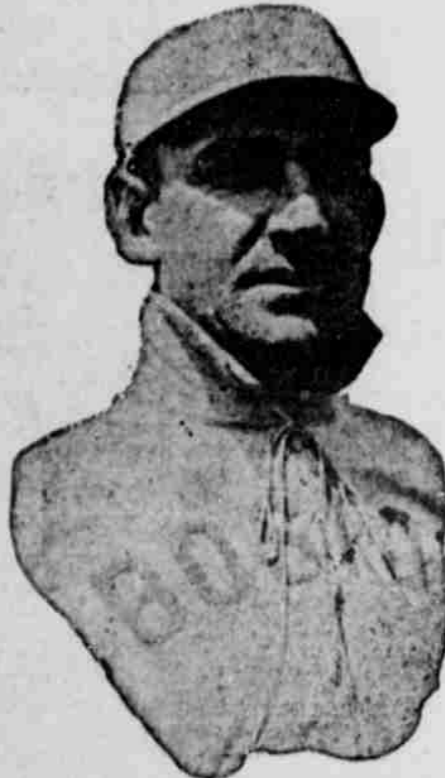
Jake Stahl, manager of the Boston Red Sox, who battled with the New York Giants for the world's baseball championship.