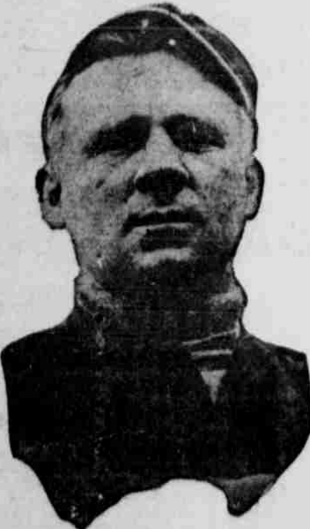
John J. McGraw, veteran manager of the New York Giants, who fought the Boston Red Sox for the world's baseball series.

The world's series of Base Ball that has been pulled off during the last few days has ended for the nationals, having up their adversities in the final game at the rate of 11 to 4. FARM LOANS!! Madras State Bank.