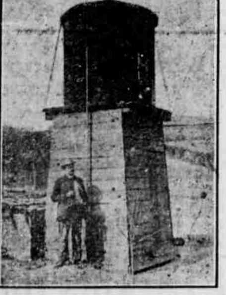
OUTSIDE TANK.

The water may go direct from pump through to poultry yard or water trough, or it may be pumped into an outside or an inside tank and may be piped from there to place of use. In the poultry yards it may run through long troughs or be caught in