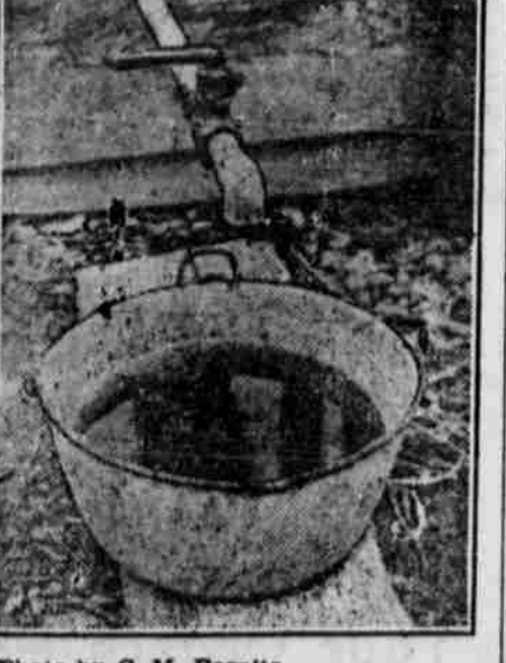
FAUCET IN POULTRY YARD.

Individual vessels, the surplus being carried off by drains. This is especially a convenience where many ducks are raised, as they drink and "slop" much water. An artificial pond may thus be made for breeding ducks and a place where