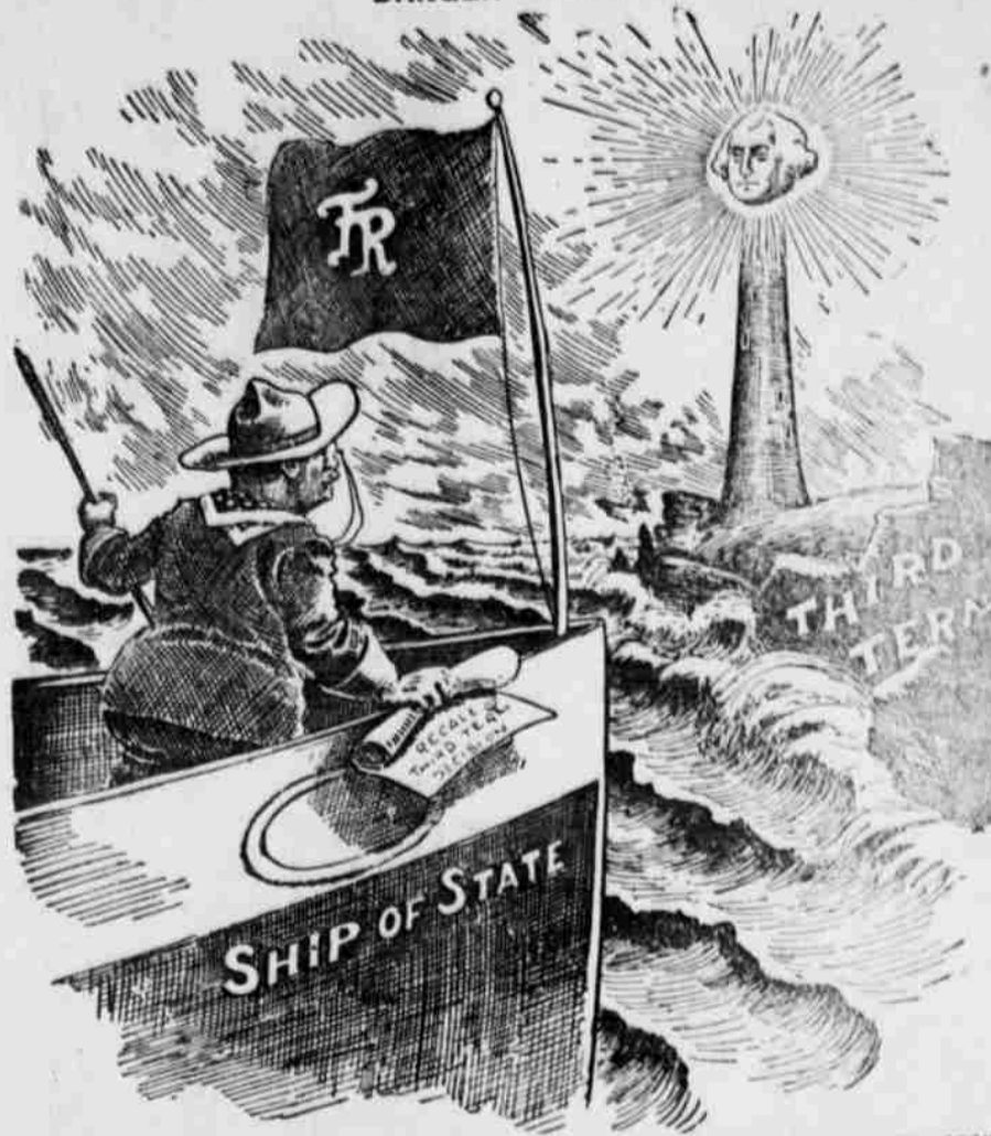
-St. Louis Globe-Democrat, March 23, 1912