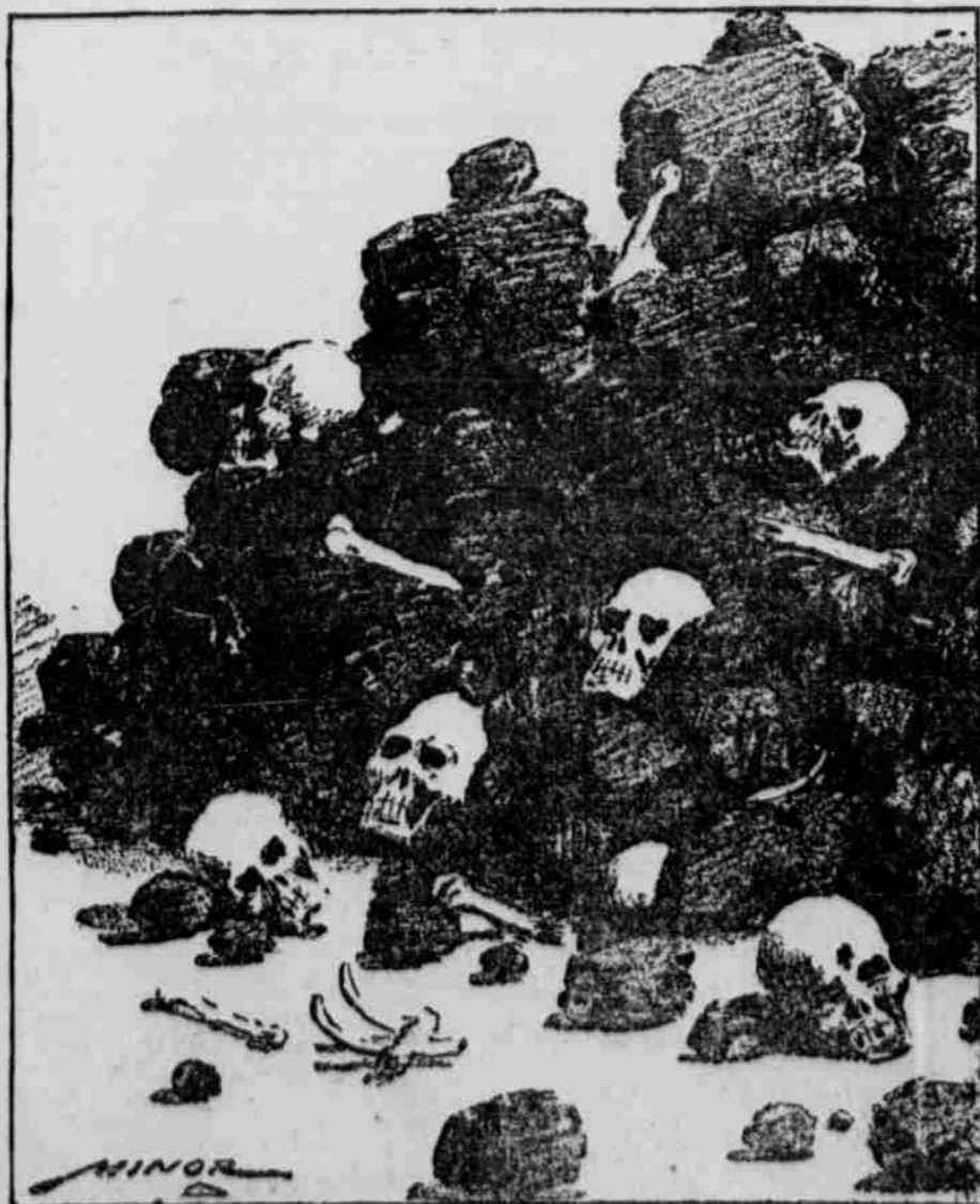
—Minor in St. Louis Post-Dispatch.