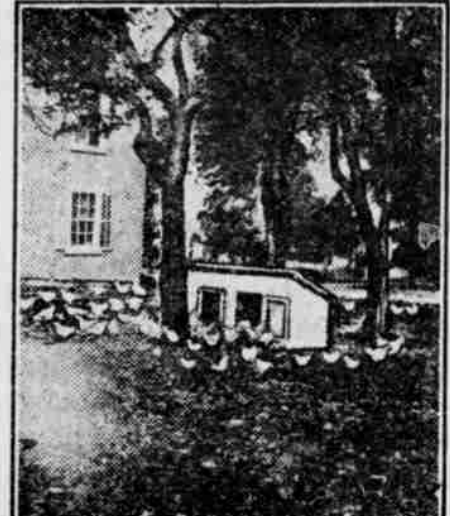
IN THE OLD ORCHARD.

It's often the weather. We believe in furnishing a variety of food and al-