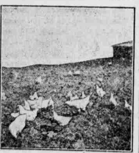
IN THE SUN'S GLARE.

How? Simply by planting sunflowers, vines and fruit trees around our poultry