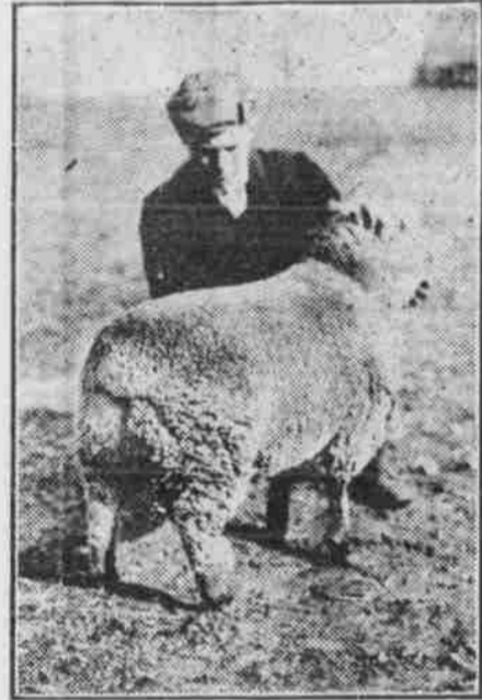
A WELL REARED SHEEP.

Do not fatten the ewes, but put them into a plump condition preparatory to