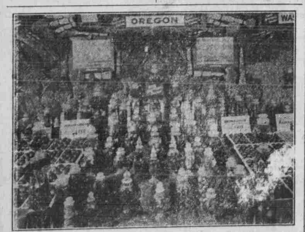
OREGON EXHIBIT BY GREAT NORTHERN RY. AT WESTERN LAND PRODUCTS EXHIBIT, HELD IN OMAHA, NEB. RECENTLY.

New Albany, Ind .- Nothing so far equals the attendance to the Oregon car such as we had at New Albany Starting early in the morning we had a steady crowd of visitors for the two days. On the evening of the second day we passed through the car not less than 1,500 people between 7:00 and 9:00 p. m. It was necessary to do this, as we left at 9:30 p. m. I would