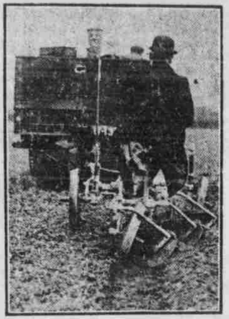
ENGLISH STEAM PLOW.

Men used to say that such an implement was a preposterous impossibility in the small field. It would take half the field to turn around in. The work of turning up its rough job of work would cost more than to do the whole thing with horses. Reasoning stubbornly in this vein, some farmers still argue to themselves that the four horse gang plow is too big for them to use. Holding close to their mind's eye the thought of the slow turning and the dog eared corners, the outside strip and the dead furrows to be finished with the small plow, they blind themselves to the machine's accomplishments. Perhaps an hour may be lost in dragging the single plow about in plowing out the corners, but what is that compared with the days and days saved in covering the bulk of the field?