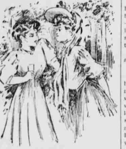
"I DO NOT WANT TO GO ALONE."

A way to the right, as far as eye could see, stretched the shimmering ocean, the sunlight dancing on the waves and turning them into a carpet of gold. To the left lay glorious patches of purple heather, broken here and there by big gorse bushes, covered with golden blooms and soft green spikes. Overhead the seagulls whirled lazily across a turquoise bay, uttering their plaintive notes as they greeted one another in passing. And one, at least, of the millions of created beings was thanking God at that very moment, as she leaned her arms on the slight railing which formed the only protection from the cruel sluff below the edge of the steep cliff. Fate had been more than ordinarily kind to Christabel Tredennis up to now. She had never known a single sorrow all her life through; twenty years of unspotted peace lay behind her. She was young, fair to look upon, wealthy beyond the dreams of most women, and dear to a manly heart, now far away in Western Africa, fighting his con-