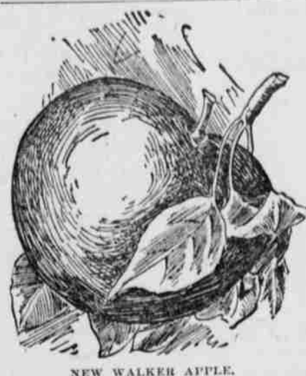
NEW WALKER APPLE.

First shown in any quantity at the Pan-American Exposition, at Buffalo, the Walker apple has since been tried in various sections and found all that was claimed for it. Its exceedingly attractive appearance makes it valuable as a market sort, and it has added merit of being of fair quality, although not by any means a first-class apple in this respect. In size it is a little above the medium, and in color is particularly attractive, being striped with brilliant red. Under test it proves to be only a fair bearer, but