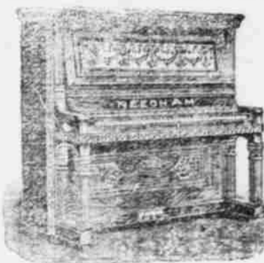
Jefferson, some to Roseburg, but the bulk of them we landed at Cottage Grove where we are doing an exceedingly fine business, disposing of eight instruments, including two fine Chickering's, three Kimball's, a fine Whitney and two cheaper makes. Cottage Grove is in a

Now that our business is spreading out and increasing, it is impossible for us to load a full carload of instruments at Roseburg at one time. Our last load was distributed, commencing at Portland; some went to Bend, some to