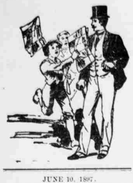
JUNE 10, 1897.