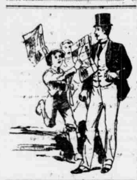
AUGUST 3, 1896.

The Weekly Plaindealer One Year. slx Months Three Months